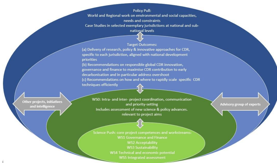
Diagram 1: project elements and target outcomes